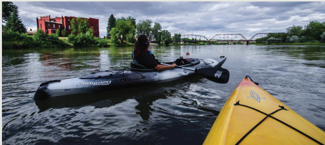
PHOTO & DESIGN CREDITS— Burnt Image Photography: River photo (opposite page), Longhorn golf photo, Kayak photo, Grand Union Hotel photo. River Press, Tim Burmeister: Old bridge, fireworks, and runners photo. Kellee Wallace: New bridge photo (lower right), Joellyn Clark Designs: Brochure design.